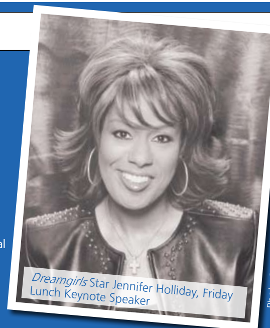
Dreamgirls Star Jennifer Holliday, Friday Lunch Keynote Speaker